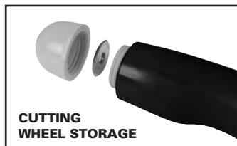
CUTTING WHEEL STORAGE

The 20 in. Brutus Tile Cutter features a convenient storage compartment in the handle, for spare 7/8 in. cutting wheels (Fig 6). Simply unscrew the handle end to open.